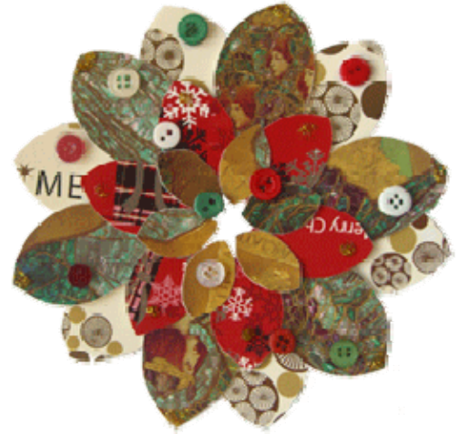
Petal hanging from used cards