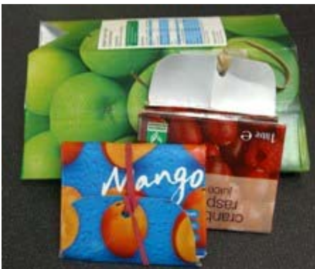
Juice carton wallets