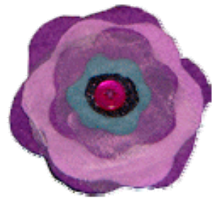
Rags to brooches