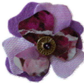
Flowers from toilet rolls, material remnants or old tights