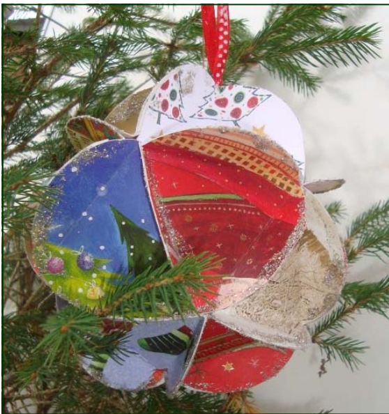
Globes from greeting cards