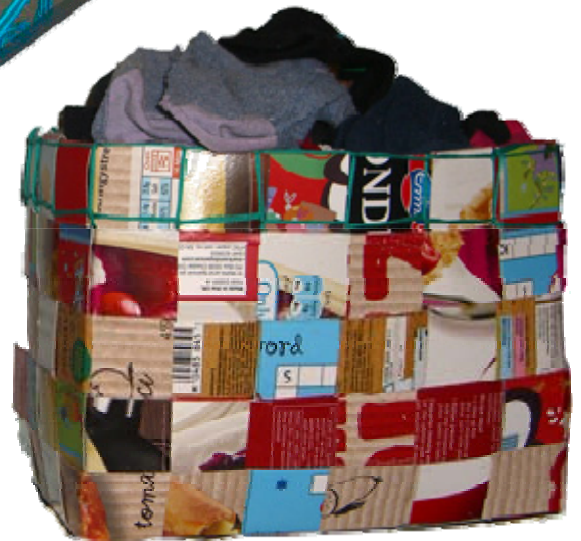
Woven food packaging box