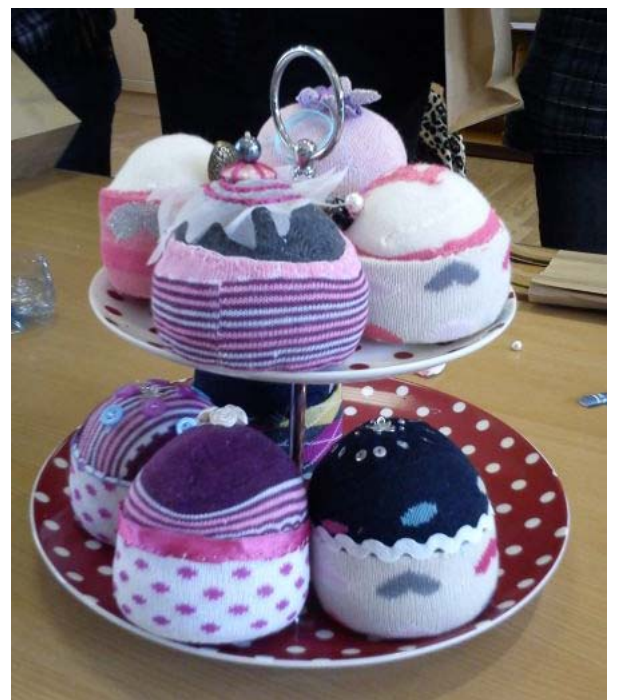
Bottle top and bottle bottom pincushions