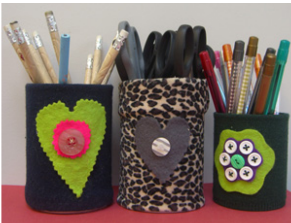
Clear-up-your-Clutter from old socks, jumpers, felt and buttons

Also popular with children, please see previous crafts: