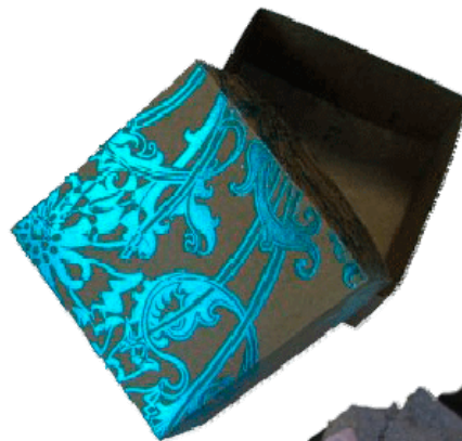
Greeting card box