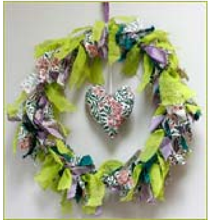
Folksy hanging from worn out clothes, with a lavender heart