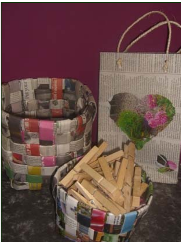
Newspaper bags and weaving