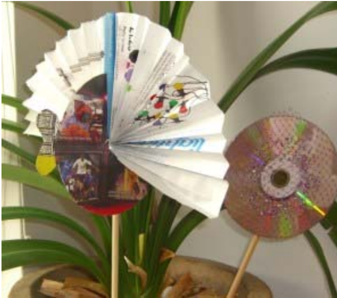
Flying fish on a stick