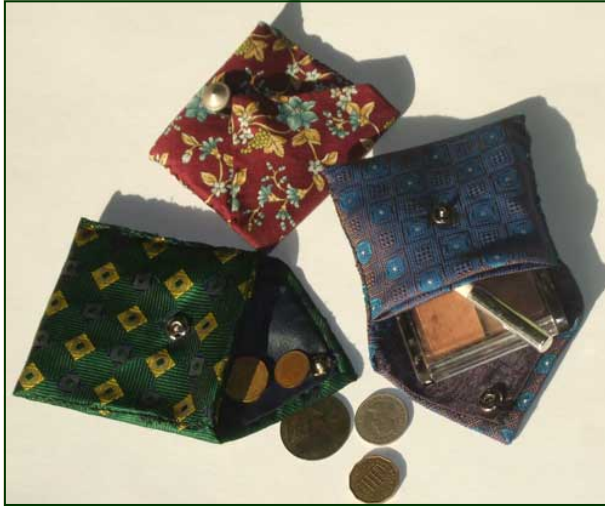
Handy purses made from ties